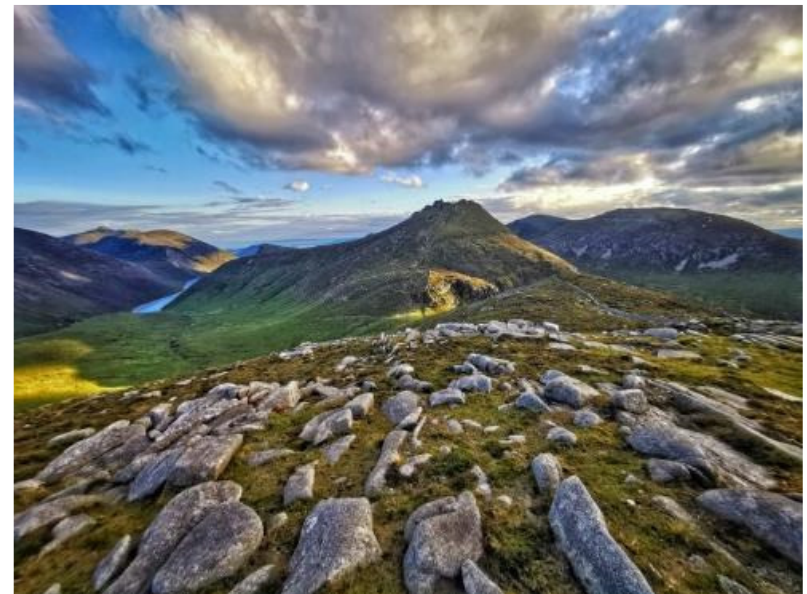
Slievenagloagh in the Mourne Mountains by Dermot Mathers