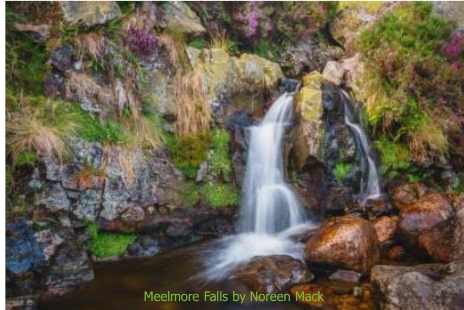
Meelmore Falls by Noreen Mack

Please note Community Capital themes are opened to constituted Community Associations (as per Council definition) ONLY