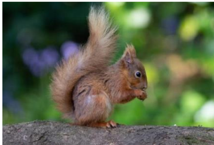
Red Squirrel by Lesley Barker

Alternatively, theme specific help can be found under the 'Useful Contacts' section of the Guidance Notes.