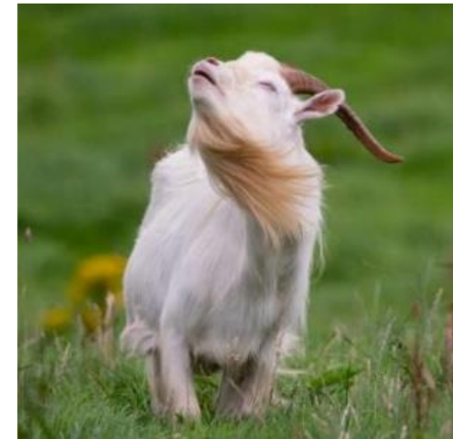
Wild Goat near Camlough Lake by Damian McConville